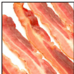
Bacon 1 Pound

According to USDA, off farm costs including marketing, processing, wholesaling, distribution and retailing account for 80 cents of every food dollar spent in the United States.