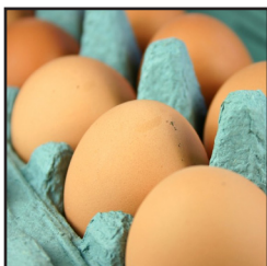
Eggs 1 Dozen