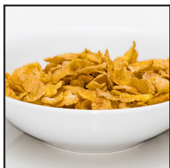
Cereal 18 Ounce Box