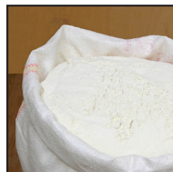
Flour 5 Pounds