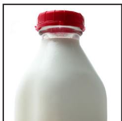
Milk 1 Gallon, Fat Free