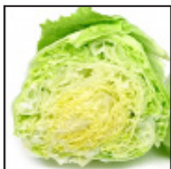
Lettuce 1 Head (2 Pounds)