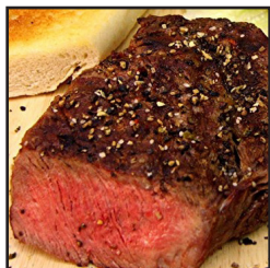
Top Sirloin Steak 1 Pound