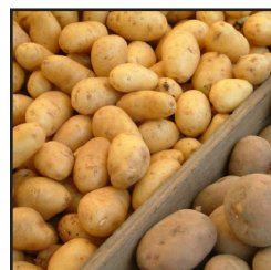
Fresh Potatoes Russet, 10 Pounds