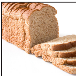
Bread 1 Pound