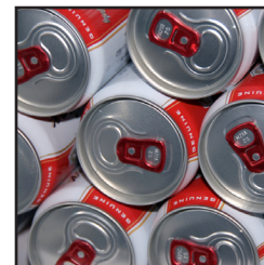
Beer 6-Pack Cans