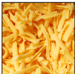
Cheddar Cheese 1 Pound