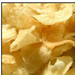
Potato Chips Lays Classic, 11oz