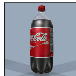
Soda Two Liter Bottle